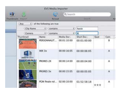
Intuitive thumbnail interface and search tools