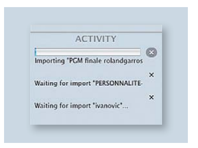
Instant availability of the media