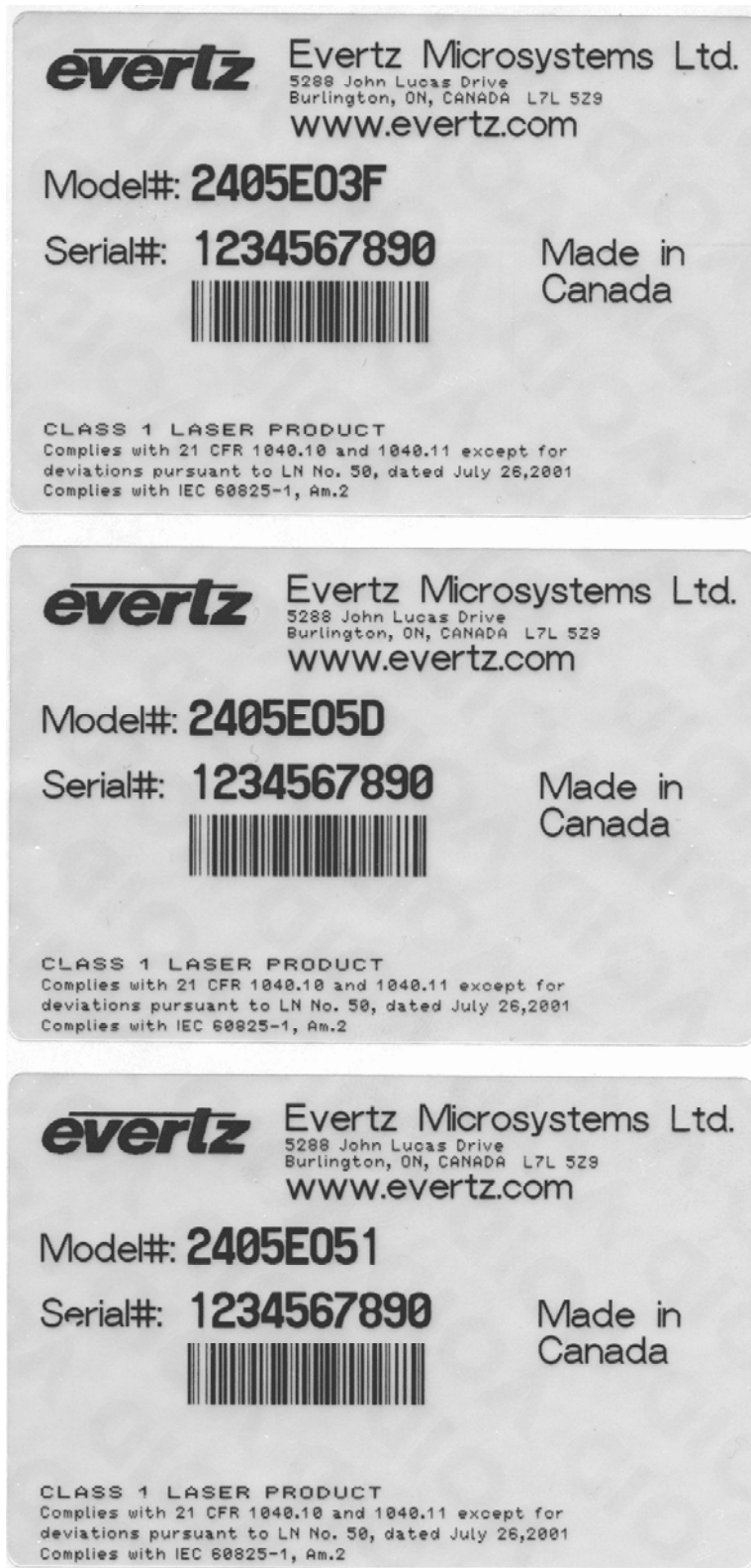
Figure 2-2: Typical 2405EO Certification and Identification Label

(Serial # and bar code differ from unit to unit)