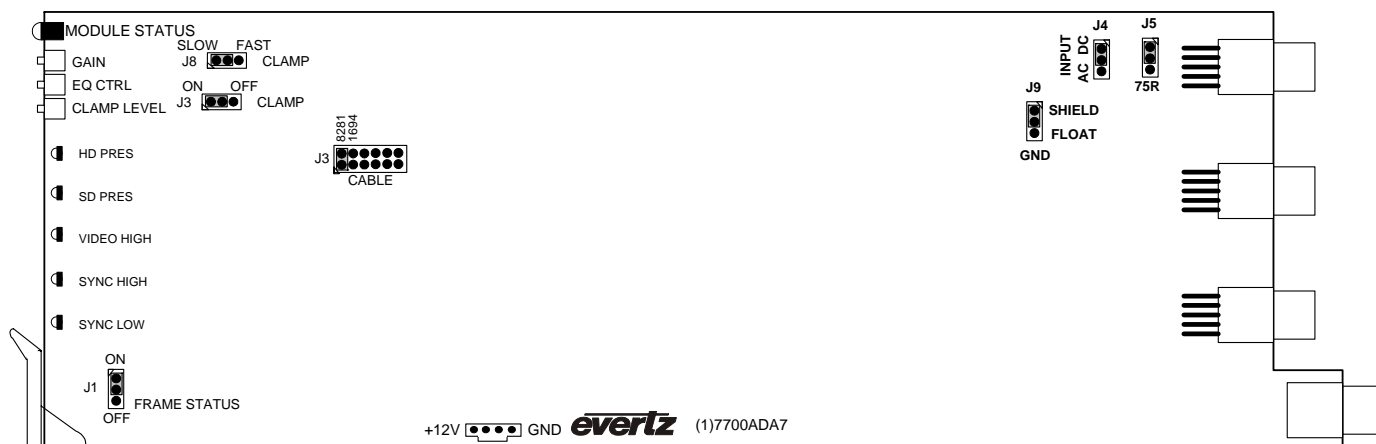
Figure 3: LED and Jumper Locations