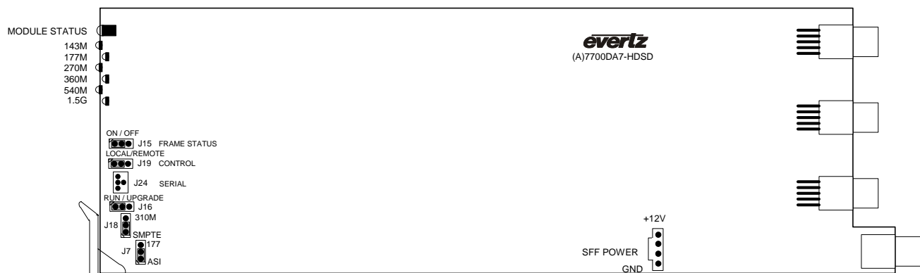
Figure 3: LED and Jumper Locations