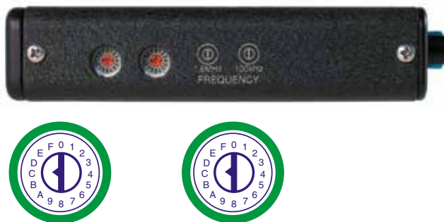
Figure 3 - Frequency Adjustment