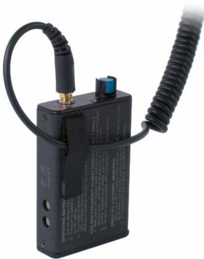
Figure 2 - Headphone cord strain relief