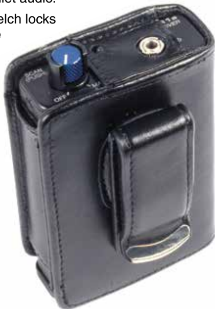
The R1a includes a leather pouch with belt clip to help protect the receiver and provide a way to secure it during use.

The receiver operates on one 9 Volt alkaline or LiPolymer rechargeable battery for up to 8 hours and features a tricolor LED low battery indicator. The voltages are internally regulated for stability.