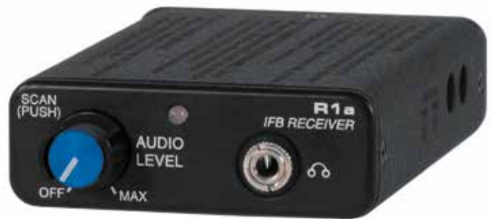
Figure 1 - R1a Control Panel

Refer to the RECEIVER OPERATING INSTRUCTIONS for full details on how to use the single knob control for channel selection, scanning, and programming of the five memory locations.