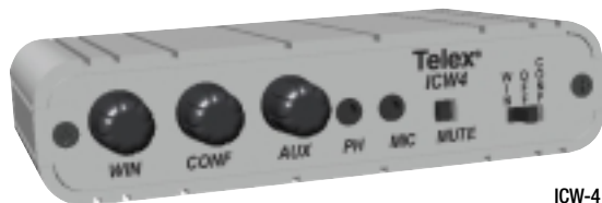
ICW-4 Intercom Use in conjunction with ICW-3