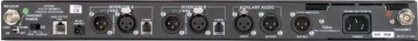
BTR-800 Base Station Back