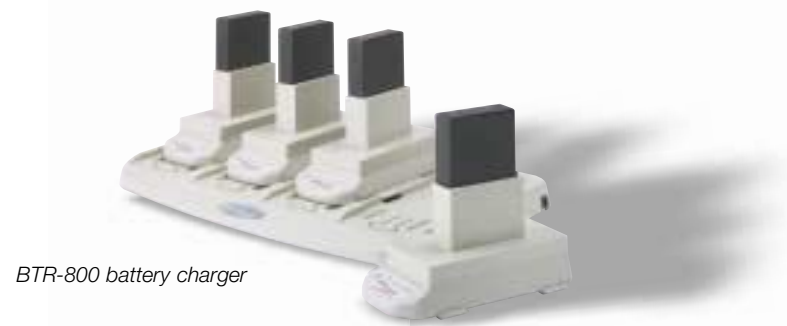
BTR-800 battery charger