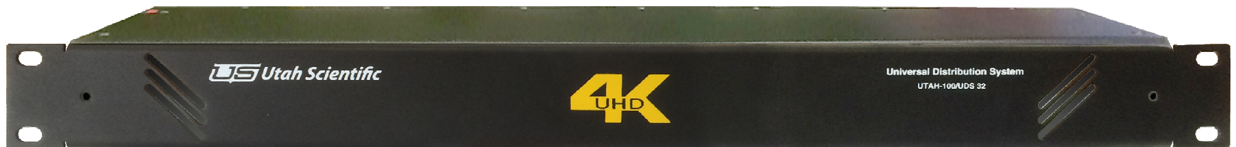
4K Model – All SDI Formats Through 4K