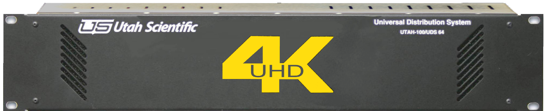
4K Model – All SDI Formats Through 4K