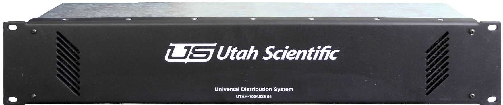
Standard UDS Model – All SDI Formats Through 3G