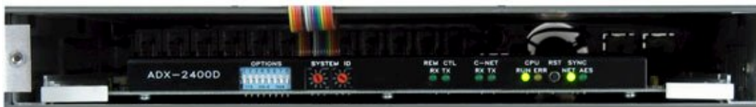
Options Dipsw ^

Turning on Section 8 will prevent changes to menu items (bundle numbers, etc.).