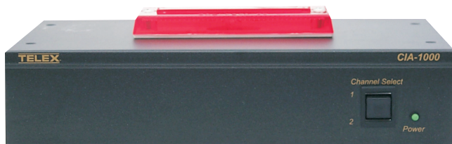
Standard Top-Mounted Light