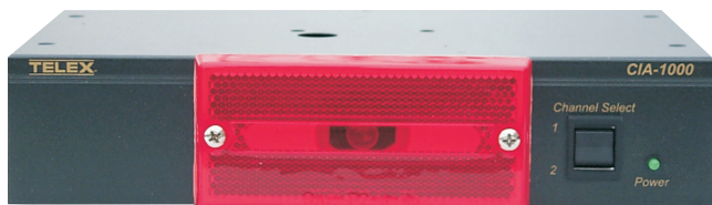
Optional Front-Mounted Light